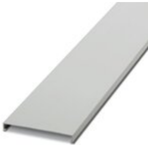
Cover for cable duct, light gray, halogen-free, width: 120 mm, length: 2000 mm

Please be informed that the data shown in this PDF Document is generated from our Online Catalog. Please find the complete data in the user's documentation. Our General Terms of Use for Downloads are valid ( http://phoenixcontact.com/download )